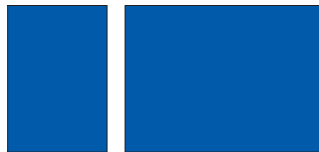
Full page 240x285