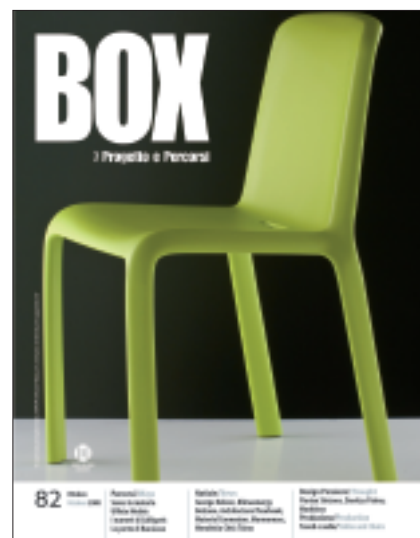
Magazine currently undergoing CSST certification

cultural hinge, articles exploring design, critiques, space for young people, their open letters and their written projects.